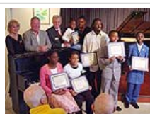
PianoKids Awards Dec 26, 2006

One moment, the small, crowded room is filled with excited chatter. The next, there's a sudden lull in the conversation.