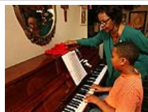
Practice, practice, practice Dec 29, 2006