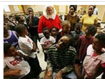
Something to sing about Dec 20, 2006